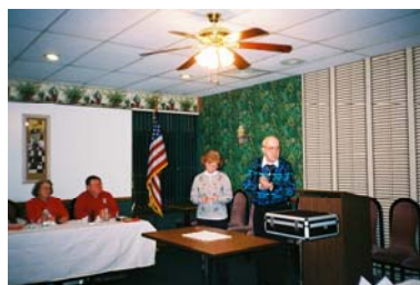
Sparkie at the 2010 kickoff dinner