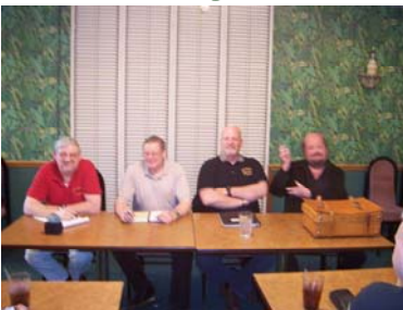
Your 2011 club officers