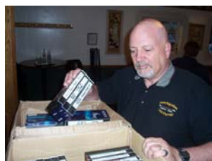
Our President and the club library